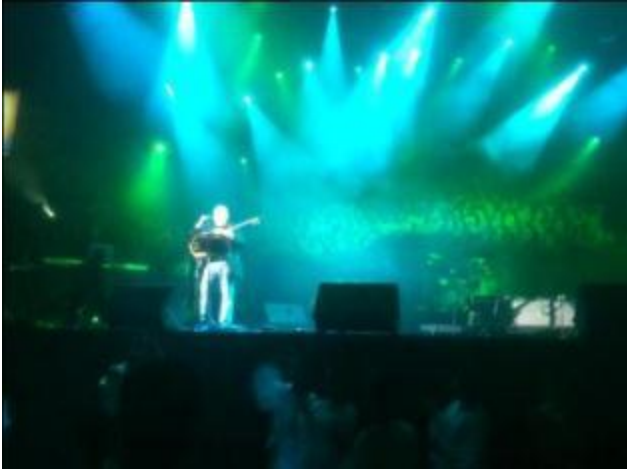
(Ministering on Friday night)